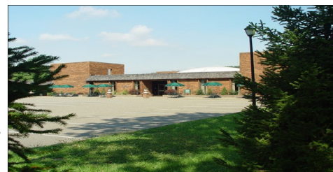
Mountainside Conference Center